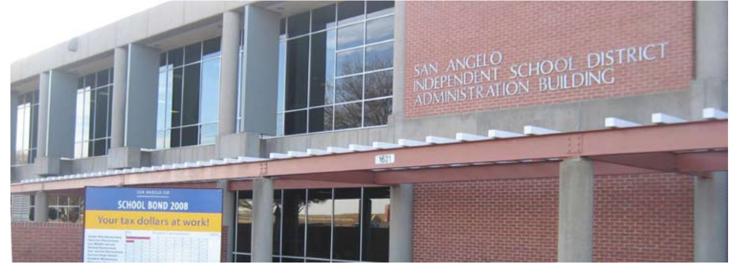
BOND PROGRAM CONSTRUCTION AND RENOVATION San Angelo Independent School District

Sebesta Blomberg provided on-site management services that managed the planning, design and execution of the project by providing project leadership, communication, coordination and conflict resolution to ensure project goals were met on time and within budget.