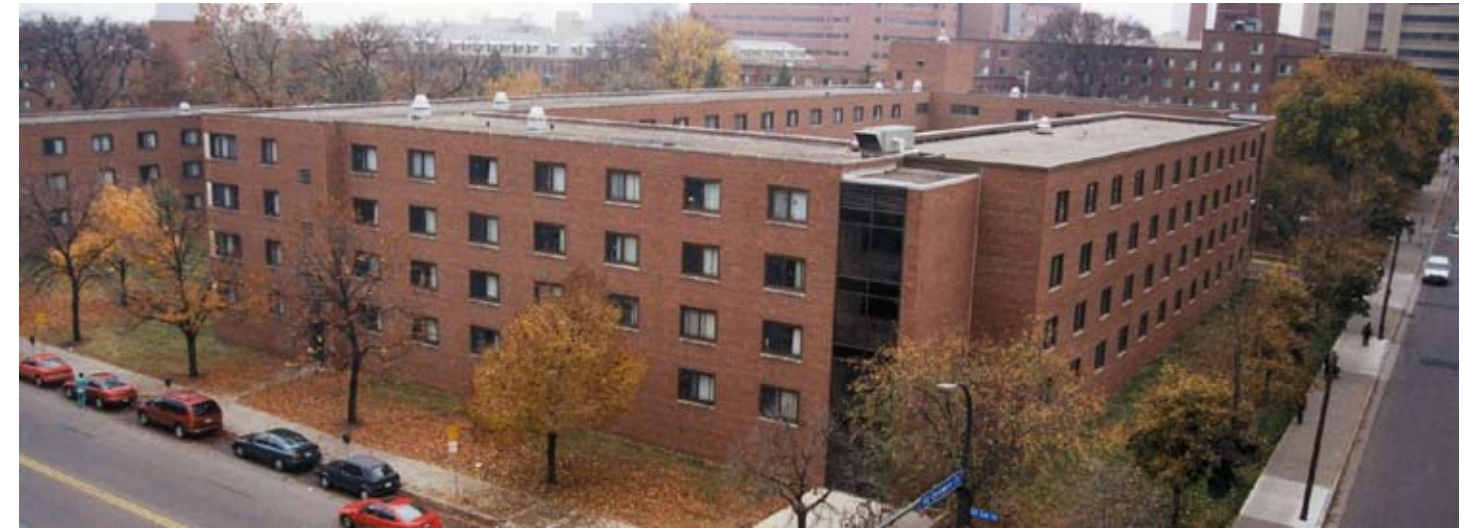
TERRITORIAL HALL University of Minnesota

Sebesta Blomberg provided owner's representation services to assist with the monitoring, sampling, application and witnessing of the contractor activities, with a strong focus on infrastructure systems. Construction support services provided technical expertise in determining completion of the contractual work associated with project documentation.