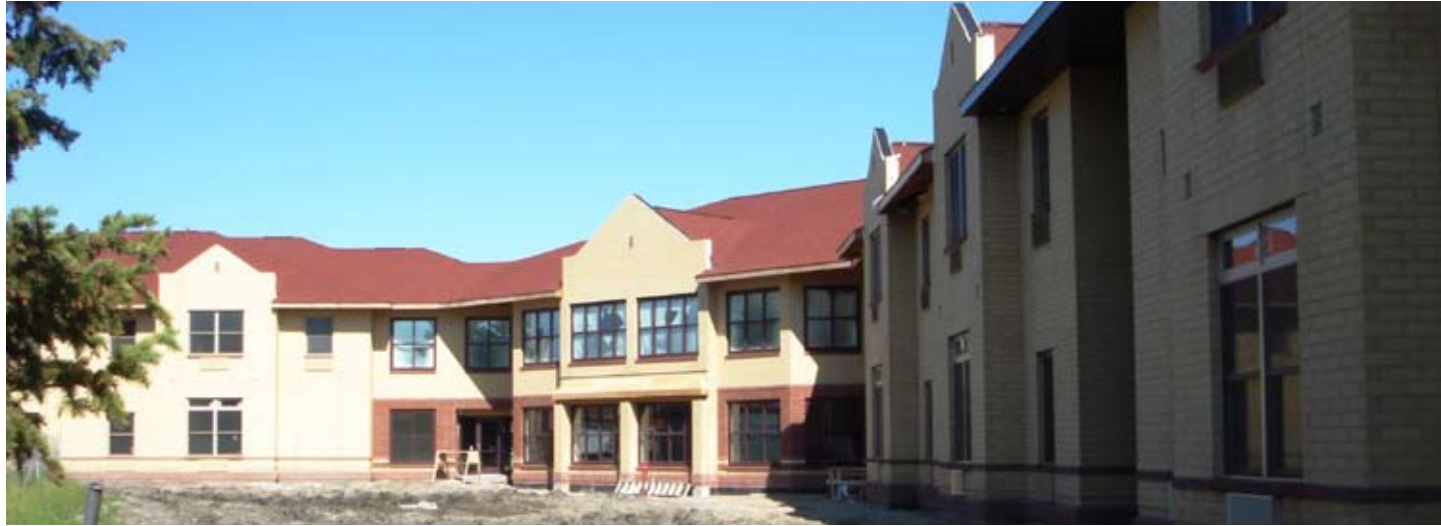
CENTENNIAL HALL II DORMITORY University of Minnesota

With campus housing occupancy rates at an all-time high, the Crookston campus underwent construction of Centennial Hall II Dormitory to meet the needs of the growing student population. Sebesta Blomberg partnered with the University to provide owner's representation services for the 53,330-square-foot, 128-bed apartment-style housing facility.