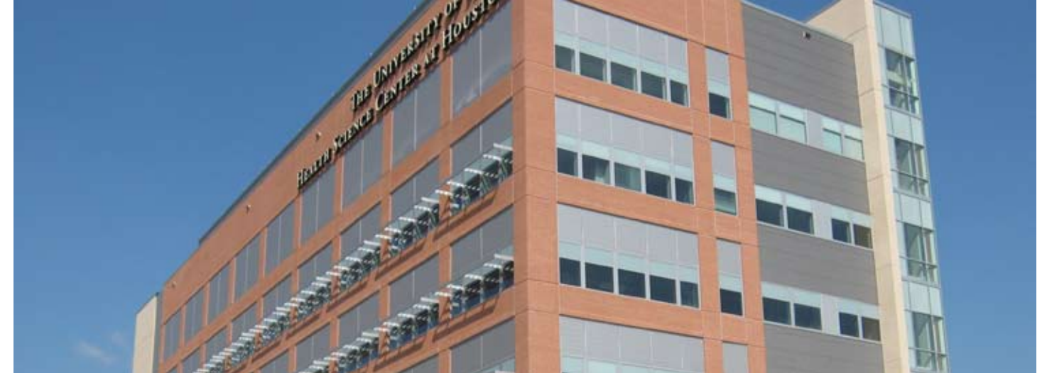
BIOMEDICAL RESEARCH AND EDUCATION FACILITY The University of Texas System

As owner's representative, Sebesta Blomberg served as the liaison between the objectives of the client and the design, development, construction and renovation, commissioning and operation of the physical assets required to meet the client's needs.