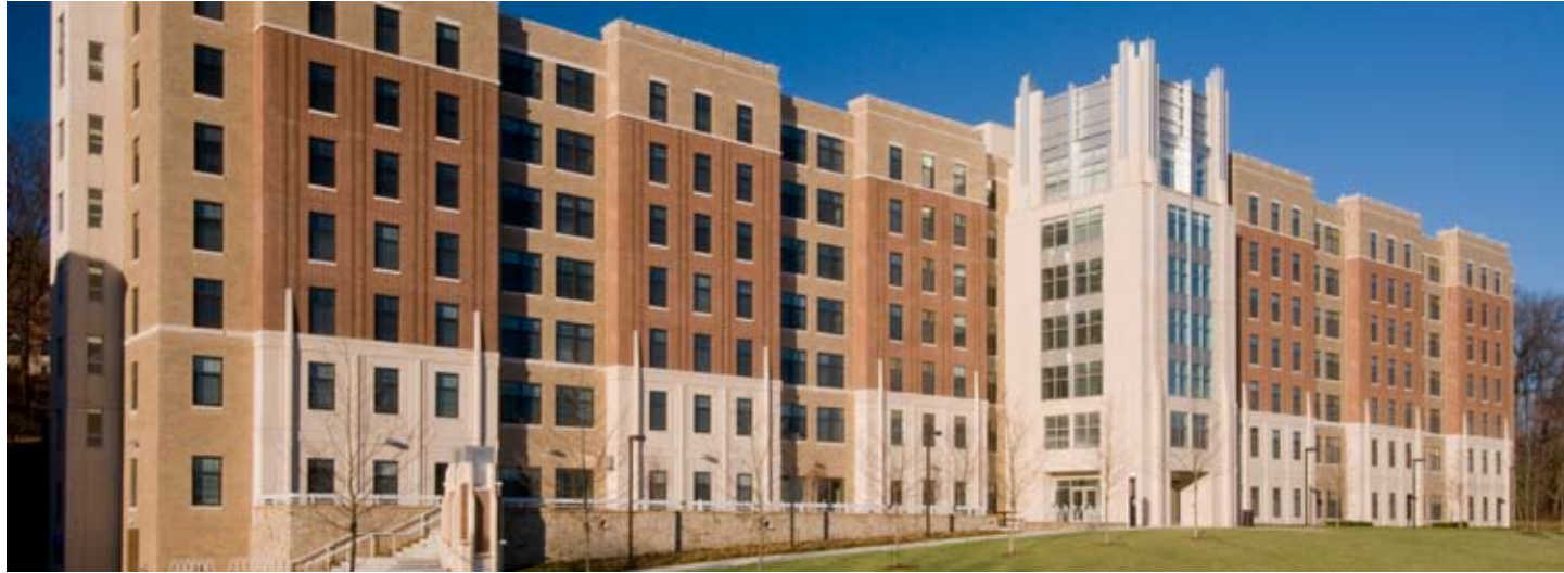
OPUS HALL DORMITORY The Catholic University of America

Opus Hall is the first LEED®-compliant residence hall among colleges and universities in Washington, DC. Opus Hall houses approximately 400 students in resident suites, with each floor boasting an expansive kitchen and common area. The Hall also contains a community lounge space, central laundry and study areas, and a 2,100-square-foot outdoor terrace.