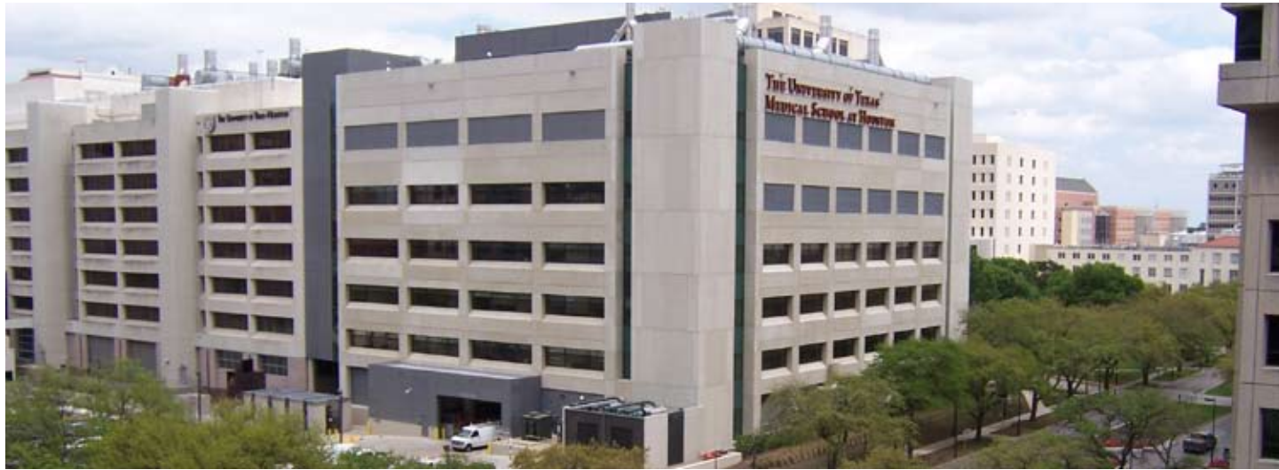
RESEARCH REPLACEMENT FACILITY The University of Texas System

The new $80 million, six-story building in Houston is home to the health science center's animal care facility and to four areas of research focus for the Medical School: the neurobiology of development, the molecular biology of human pathogens, physiological genomics or systems biology, and structural biology.